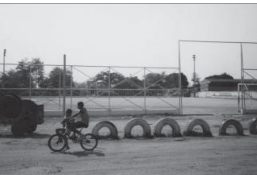
Children pedal past a Barrancabermeja soccer field where paramilitaries massacred six and disappeared twenty-seven people in May 1998, during their push for control of the city.

In spite of the extremely difficult atmosphere in which democratic actors find themselves in Colombia, the delegation saw many examples of civil society-led efforts designed to increase the prospects for peace through integrated, participatory development programs. We visited three of these efforts, of which the best known is the Program on Development and Peace in the Middle Magdalena river valley (PDPMM), covering 29 municipalities in four provinces. In Cauca, we met with more than twenty social