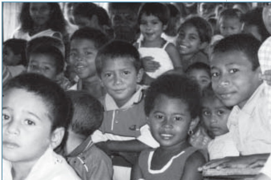
Delegation members met with children from the displaced community of Cristo Viene at their school, established by Justapaz, a ministry of the Mennonite Church.

The delegation found that the risks to democratic actors have not abated since President Álvaro Uribe took office in August 2002. On the contrary, civil society leaders continue to be targeted by illegal armed groups, the state continues to fail in its obligation to protect the exercise of the most basic human rights, and powerful voices in the government are calling for reforms to